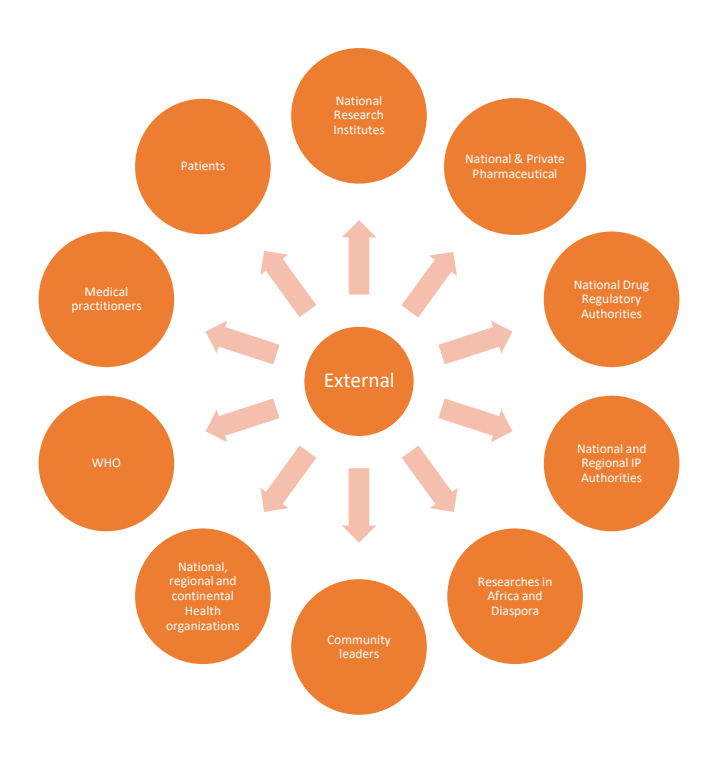
Figure 2. External stakeholders

Stakeholder Mobilization and engagement is imperative to ensure that the output is widely appreciated and that it will benefit the targeted groups and communities. This is also to ensure the active participation of the stakeholders in all the project steps, as such they will be more committed to the dissemination and implementation of the projects output and recommendations.